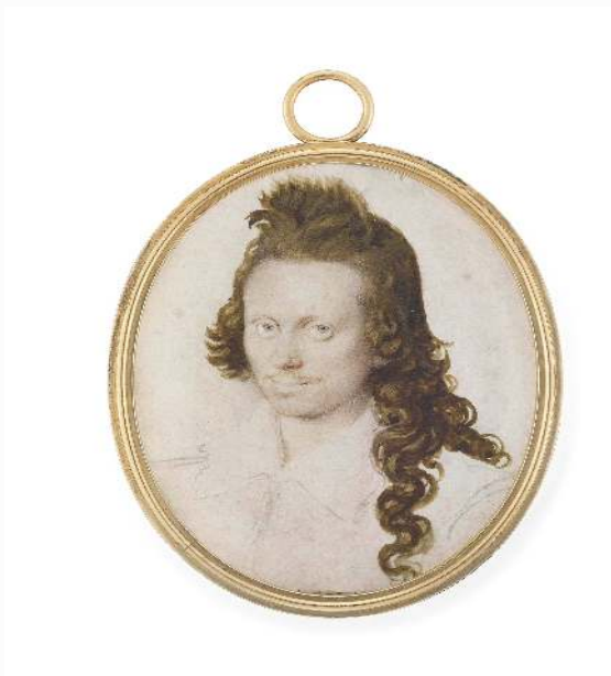
Figure 9 Isaac Oliver, Henry Wriothesley, 3rd Earl of Southampton , circa 1565–1617, watercolour on vellum, laid onto card, 6.5 x 5.2 cm. Private Collection.

The surviving evidence suggests that Oliver produced such replica miniatures of only a very few sitters, all of whom in the 1590s appear to be connected with Essex, although it is of course reasonable to assume that some miniatures have been lost. Aside from Essex himself, the most replicated miniature by Oliver of the late Elizabethan period is that of Sir Richard Leveson, which exists in three high quality versions, in the Wallace Collection (fig. 10), at Welbeck (Portland Collection) and at Charlecote Park (National Trust). Leveson was not a particularly high profile Elizabethan courtier, but he was a close associate of Essex. He captained one of the ships on Essex's Cadiz expedition in 1596, and was knighted as a result, and also went on the Azores expedition of 1597. Like Essex, he wears a long, rectangular beard in the miniatures, although his wide collar may suggest that the image was painted a few years later than that of Essex. There is no known evidence for the commission of Leveson's miniatures; they could have been painted for loved ones before he left for potentially dangerous voyages, or for friends or patrons to celebrate his naval or other successes. But Leveson's association with Essex is significant in the context of him also being the subject of replica miniatures. 40