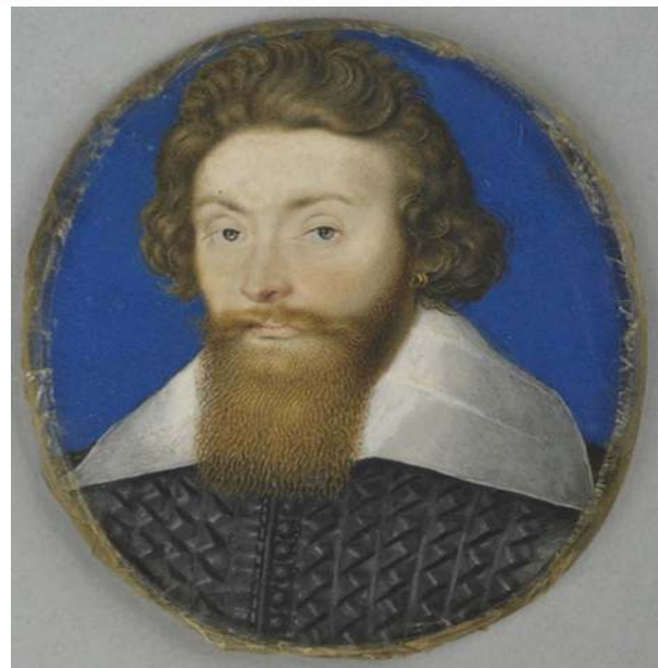
Figure 10 Isaac Oliver, Sir Richard Leveson , circa 1595–1600, watercolour on vellum, laid onto card, 5.1 x 4 cm. Wallace Collection, London (M287).

Two miniatures by Oliver from the late 1590s, now in the Nationalmuseum in Stockholm, seem likely to record another of Essex's associates (fig. 11). The sitter is currently identified as George Clifford, 3rd Earl of Cumberland; the face is the same in both portraits, but in each he wears different clothing. A fair-haired man with a blond beard that, unusually, is both wide and long, in one miniature he wears a black doublet and a wide-brimmed black hat with a black plume, and in the other an embroidered jacket with a blue cloak over one shoulder. He does not, however, resemble Clifford in any authentic portraits. Clifford's appearance is well recorded, including in portraits commissioned by his daughter Lady Anne Clifford, Countess of Pembroke, and in