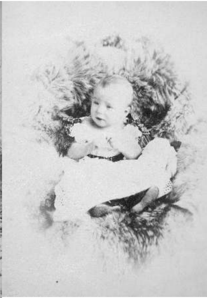
Figure 20 William Notman, Mrs Colonel Ferguson's Baby, Montreal, QC , 1863, silver salts on paper mounted on paper, 8.5 × 5.6 cm. McCord Museum (I-6153.1).