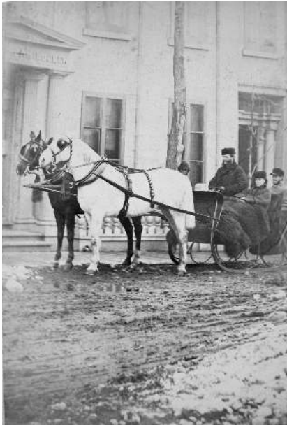
Figure 19 William Notman, Colonel Ferguson's Sleigh and Pair at Notman's Studio, Bleury Street, Montreal, QC , 1863, silver salts on paper mounted on paper, 8.5 × 5.6 cm. McCord Museum (I-6600.1).

a voluminous fur sleigh robe across her lap (fig. 19). Notman also photographed Baby George Arthur nestled in fur (fig. 20). The Fergusons even made use of Notman's indoor "winter scenes" studio, where they posed with a sled and snowshoe with lambswool on the floor to simulate snow, sporting fashionable fur coats and hats made from a variety of animals (fig. 21).